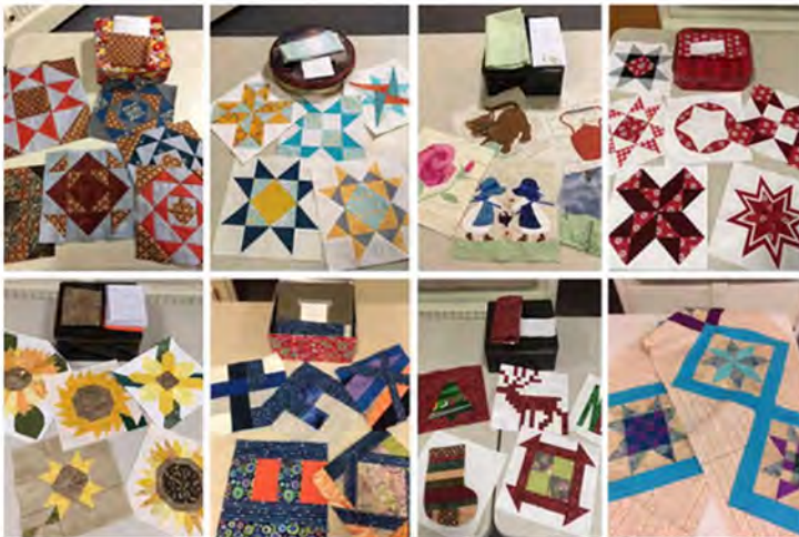
These beautiful blocks are the results of the Tinner's Challenge seen at the May meeting. It sure looks like everyone had fun. Thanks to all who participated!