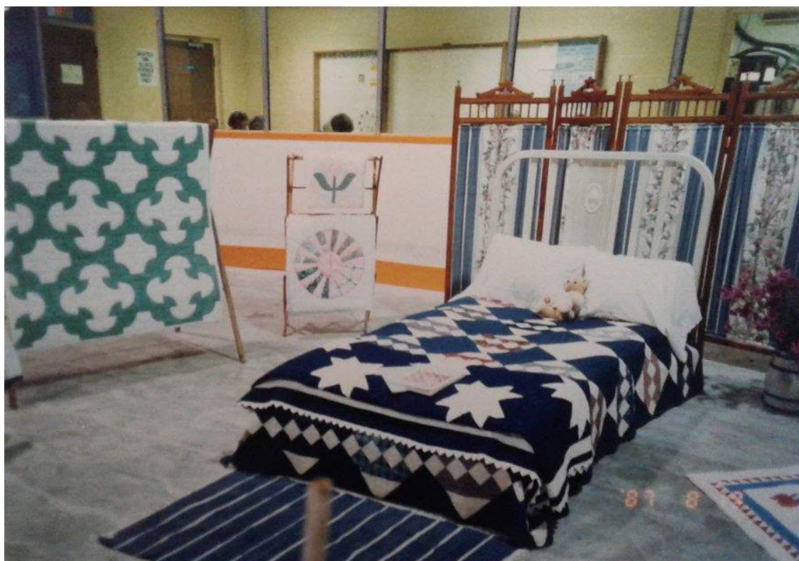
Photo taken at our Guild's first Quilt Show