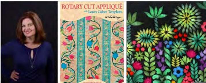
Sue Pelland is coming to our September meeting and there will be a workshop too!

Sign ups have started and your place in the class is confirmed on payment.