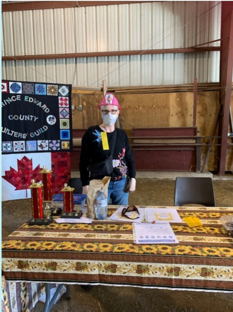
PICTON DRIVE THRU FAIR