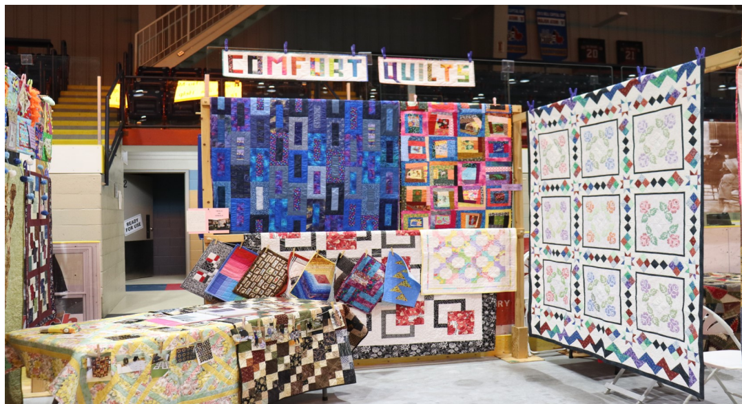
Quilt Show 2023