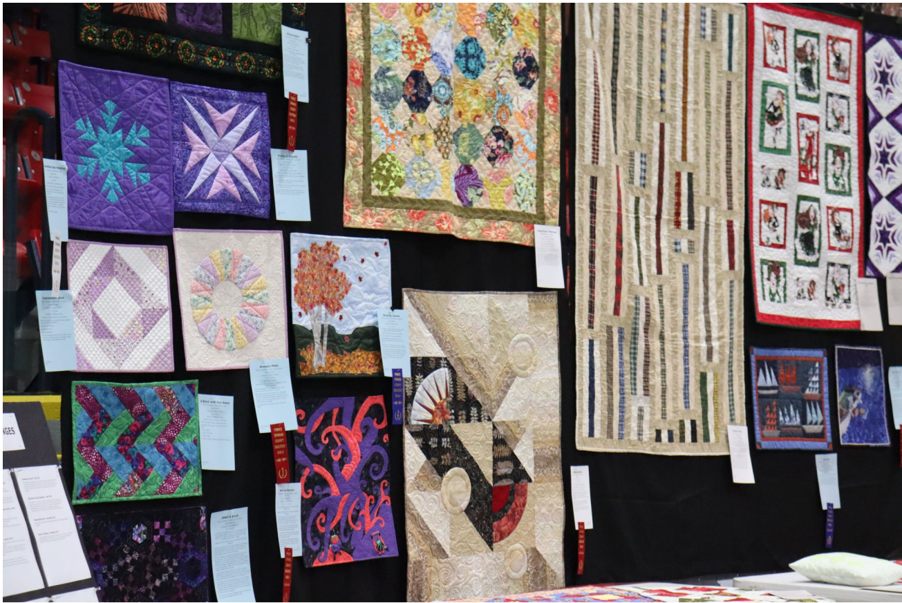
Some of the Challenge Entries shown at our Quilt Show