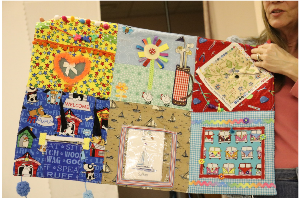
Hanne-Lise displays one of her Fidget/Touch Quilts at Show and Share