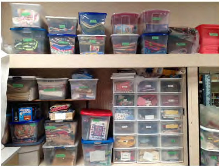
Comfort Quilt supplies: all tidy and ready to be used!