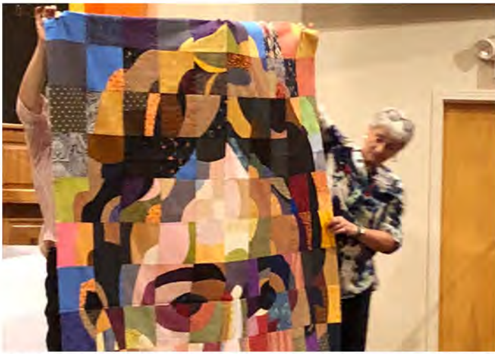
Colour Group volunteers holding up quilts the Jack Edson Program in October, 2018