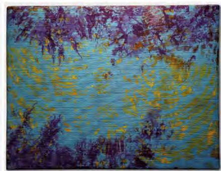
Dye Painted/Mono Print on Vintage Table Linen, 2016