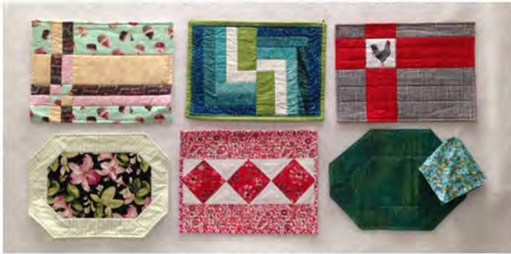
Some placemats already received